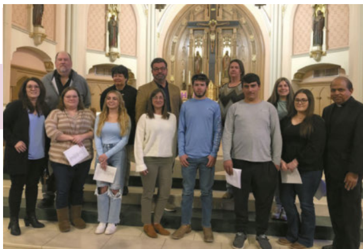
OCQA Rite of Election at the Cathedral of St. Francis