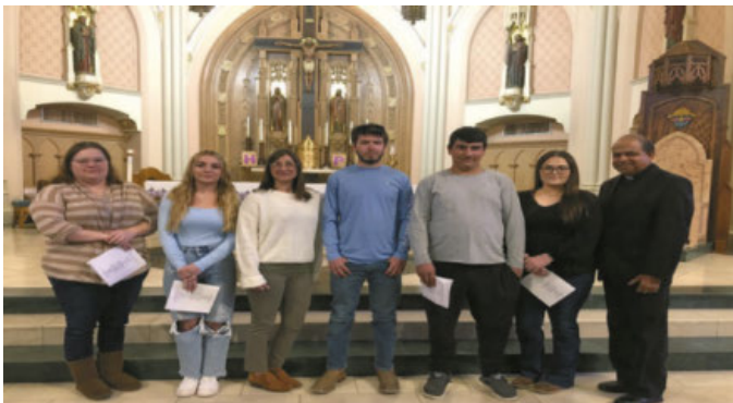
St. Joseph OCJA Candidates