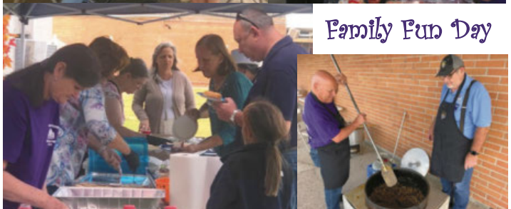
Family Fun Day